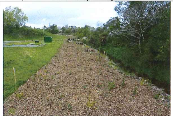
6. Sept 2014 – Completed planting/mulching