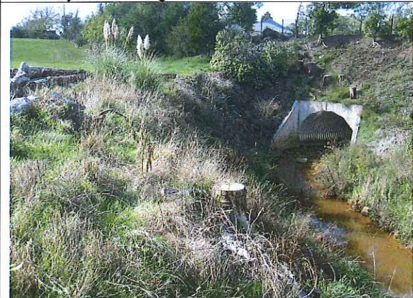
3. April 2014 – Part way through weed control