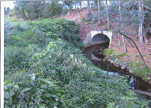
1. July 2013 – Significant weed issues