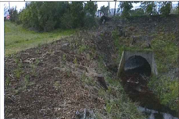
5. Aug 2014 – Post planting