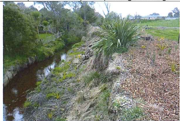
8. Sept 2014 – Completed planting/mulching