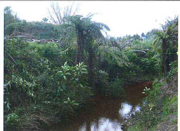
2. July 2013 — Significant weed issues