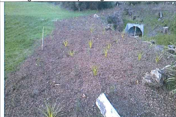
7. Sept 2014 – Completed planting/mulching