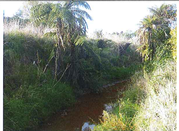
4. April 2014 – Part way through weed control