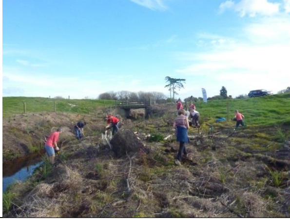
Golden Farms - downstream, planted by MSCG