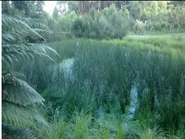
Sandford Park wetland – waiting for mudfish