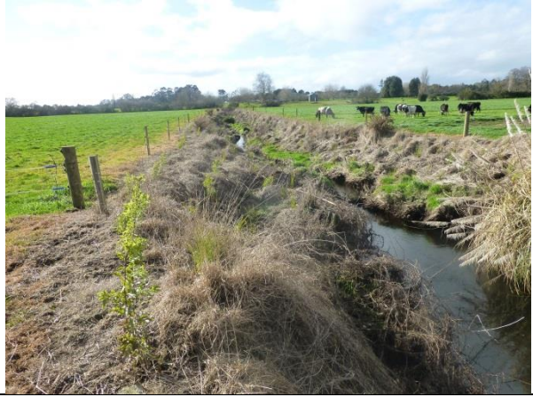
Golden Farms – upstream, planted by contractor