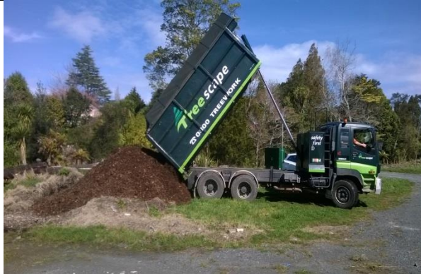
Collins Road Marae – thanks Treescape !!