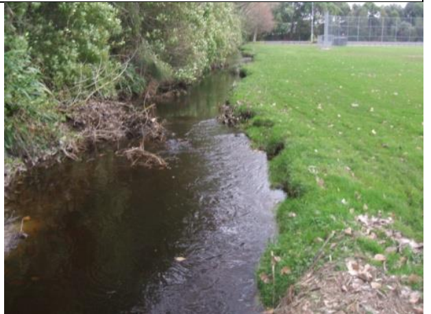
Resthills Park – 520m of eroding stream edge, no weeds though and easy access for planting.