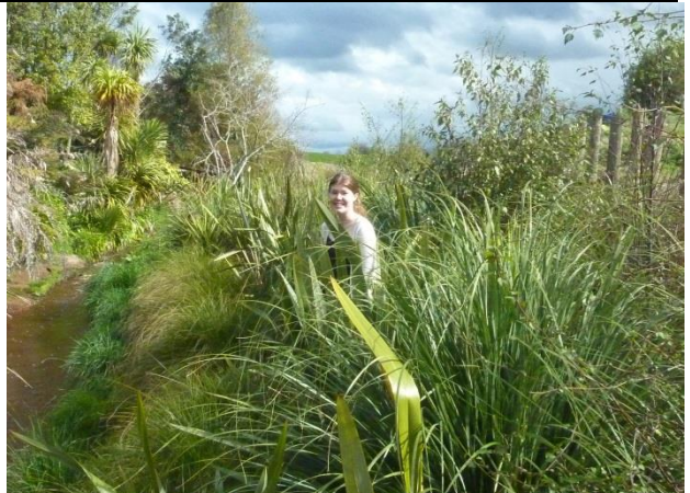
Saxbys Road, 1yr old planting, 18yr old planter!