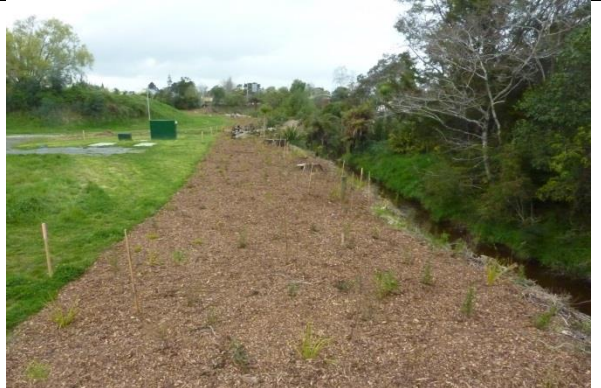
Collins Road Marae, freshly mulched, great!