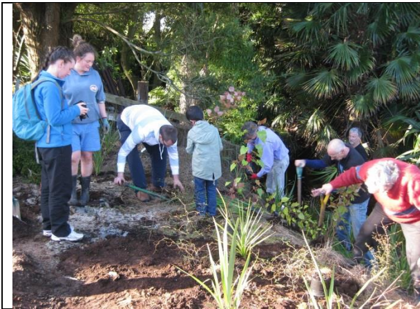
Saxbys Road – 400 plants in 1 hr!!