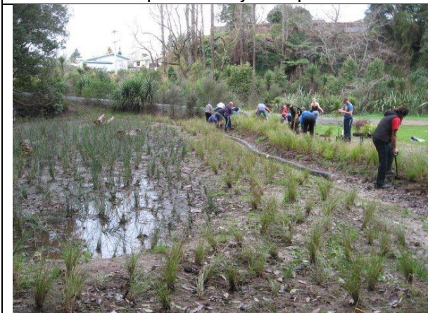
Sandford Park - wetland planting day