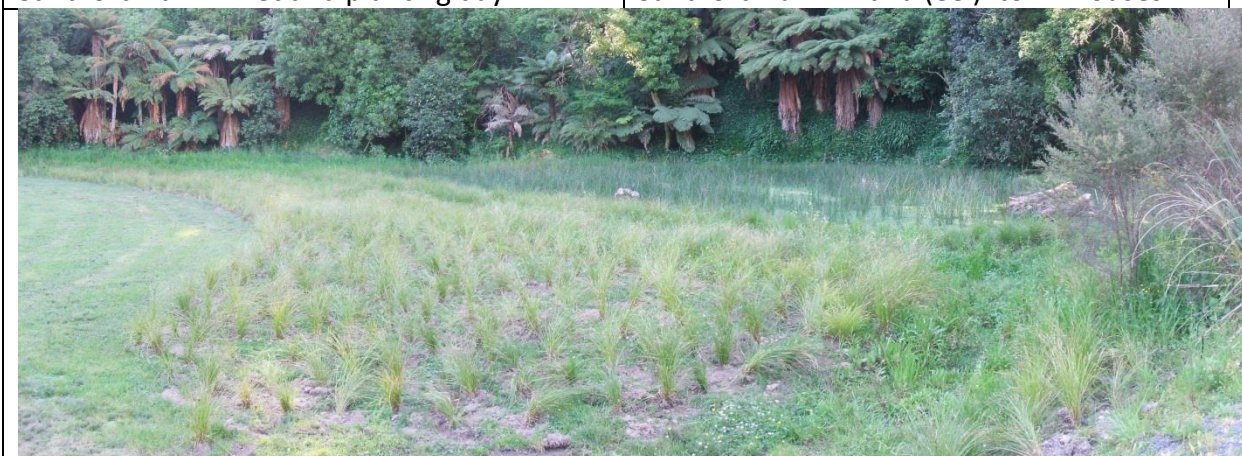
Sandford Park - completed wetland area, looks great, ready for mudfish (winter 2014)