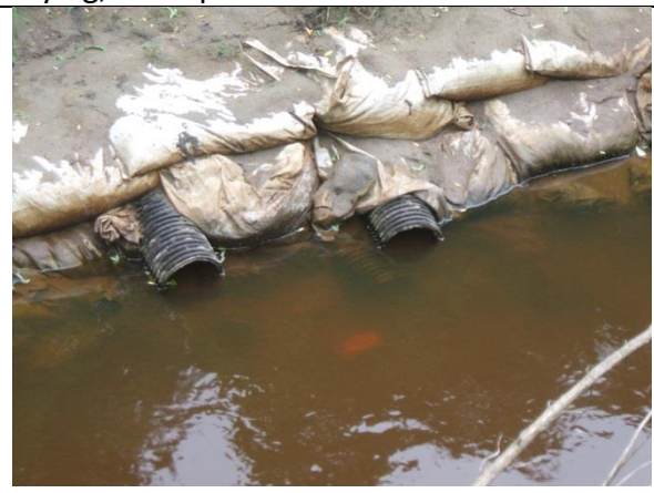
Sandford Park - Tuna (eel) 'town houses'