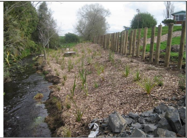
Saxbys Road –100% weed control, mulched