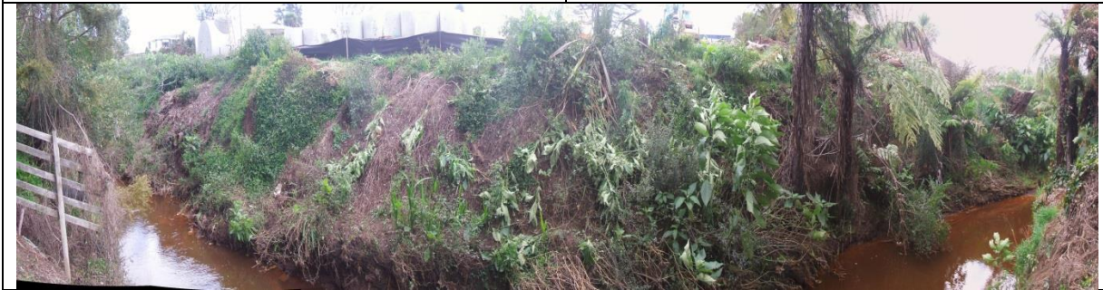
Collins Road Riparian Project – prior to weed spraying, to be planted 2014