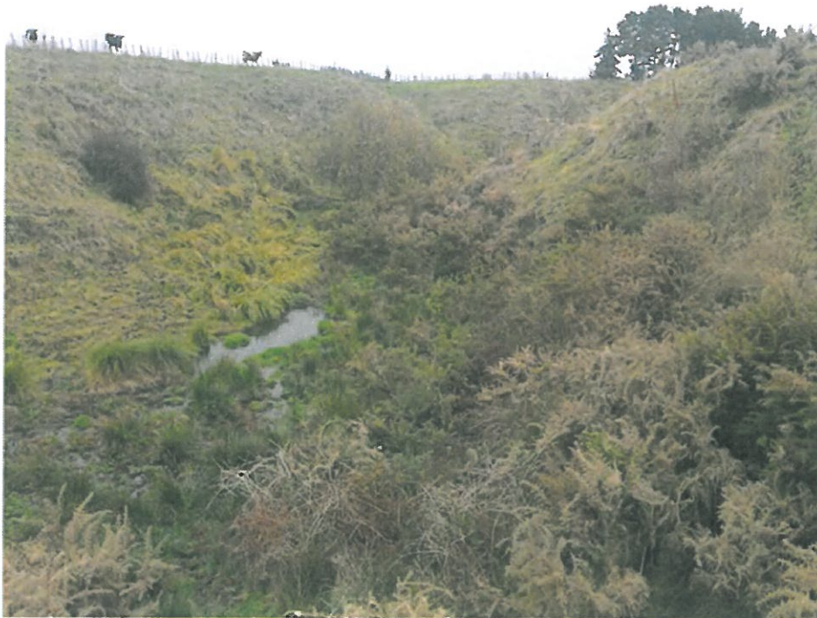
Photo 10. SNA 56 gully base.