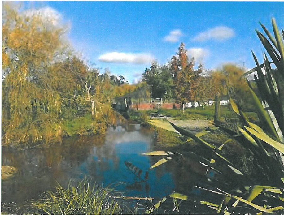
Photo 13. The highly modified artificial ponds at site 6.

restoration riparian and wetland planting with appropriate indigenous species within the remaining pond areas. The artificial nature of the habitat at this site does not trigger any of the WRC Ecological Significance Criteria.