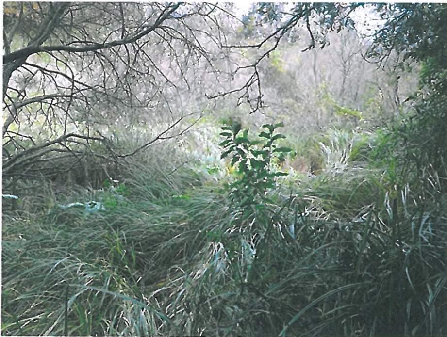
Photo 24. Site 13 Stormwater: Carex geminata dominated wetland with Salix canopy at the gully floor.