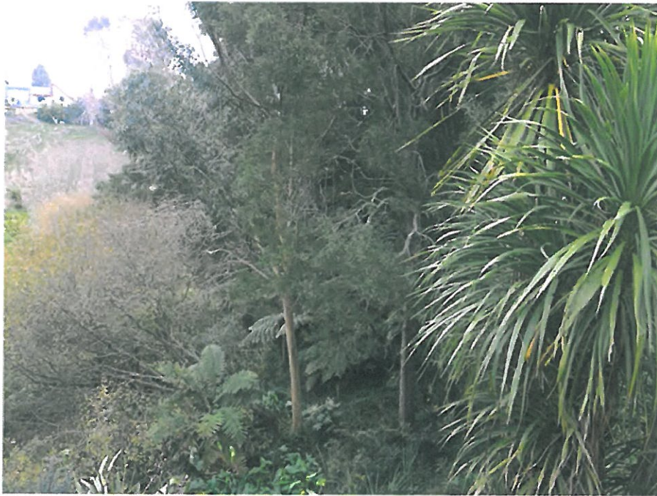
Photo 23. Site 13 Stormwater: Exotic dominated slope vegetation grading into Salix canopy with C. geminata dominated wetland vegetation.