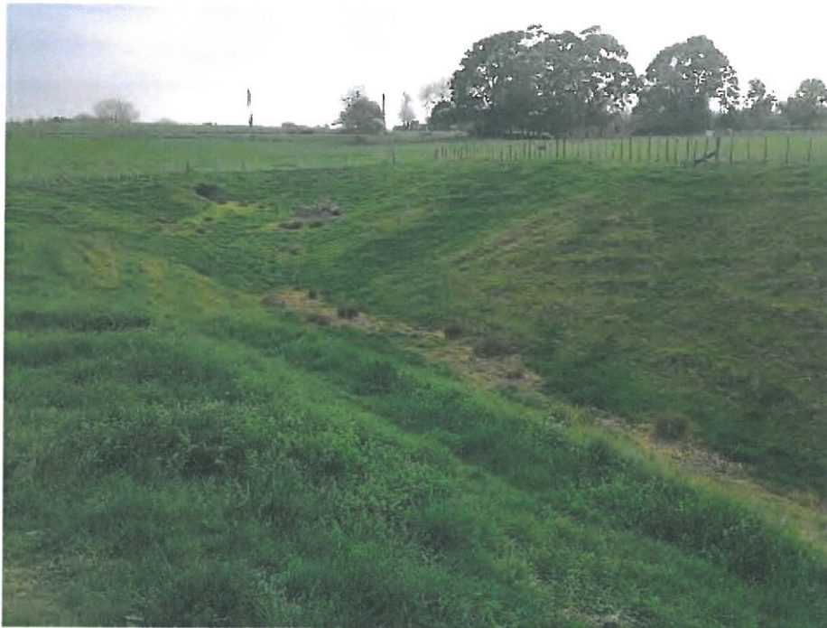
Photo 12. Habitat at site 5f.

Significance of site – This finger of gully will be filled however no significant indigenous vegetation or habitat will be affected by the project at this site. The habitat does not trigger any of the WRC Ecological Significance Criteria.