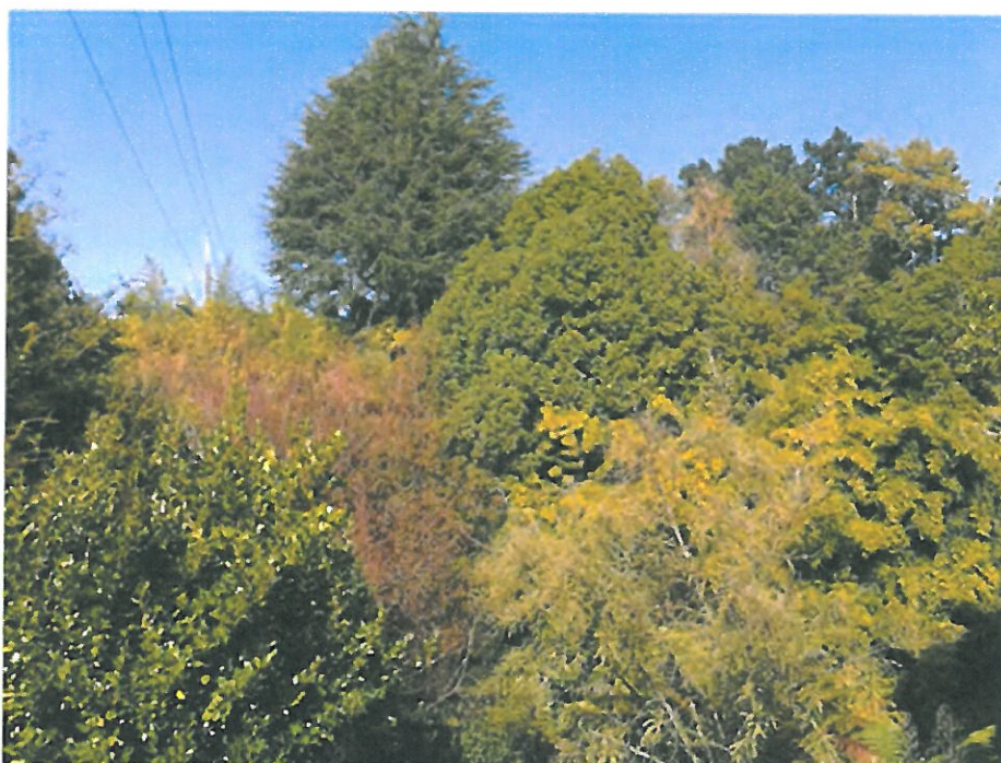
Photo 1. Exotic canopy mixed with planted natives, representative of >50% of site 1.