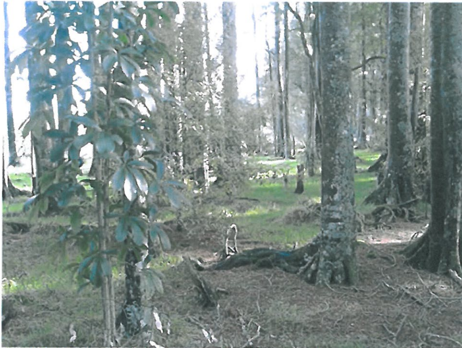
Photo 15. Remnant kahikatea stand with sparse natural regeneration beginning to create a sub-canopy.