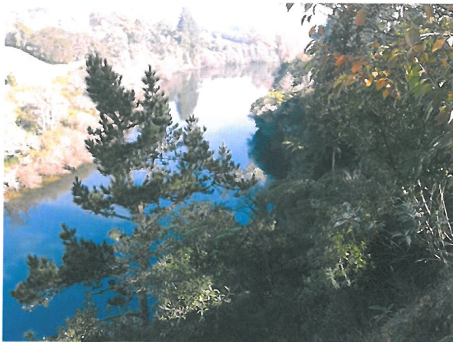
Photo 3. Regenerating riparian forest, comprising >50% of the site, mixed with scattered Pinus .