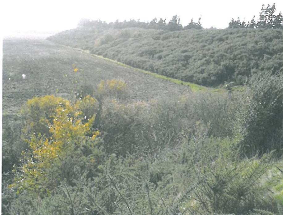
Photo 6. Exotic species, including grey willow and gorse comprising >95% of the site.