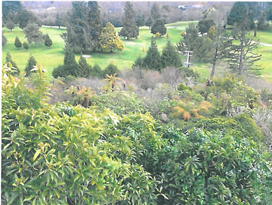
Photo 21. Regenerating native canopy of the slope on Site 13, grading into Salix below.

Significance of site – Some indigenous wetland vegetation, comprising 40% of the site, will be impacted by the project. While the wetland area is compromised by the abundance of arum lily it could be classed as significant under criteria 6 of the WRC criteria for ecological significance. Long-tailed bat activity is known at this site and this will also trigger Criterion 3. The site is not listed as an SNA under the proposed WCC DP.