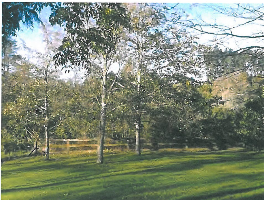
Photo 19. The Spring-Patterson property, looking towards the Waikato River.