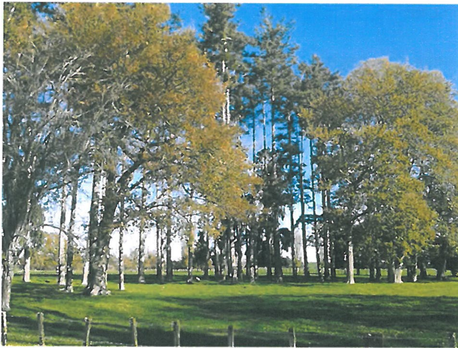
Photo 26. Douglas fir plantation and mature English oak at Site 15.

Significance of site – No significant indigenous vegetation or significant habitat of indigenous fauna will be lost. Exotic vegetation comprised 100% of the site. Long-tailed bat activity is known at this site and this will trigger Criterion 3 of the WRC criteria for ecological significance.