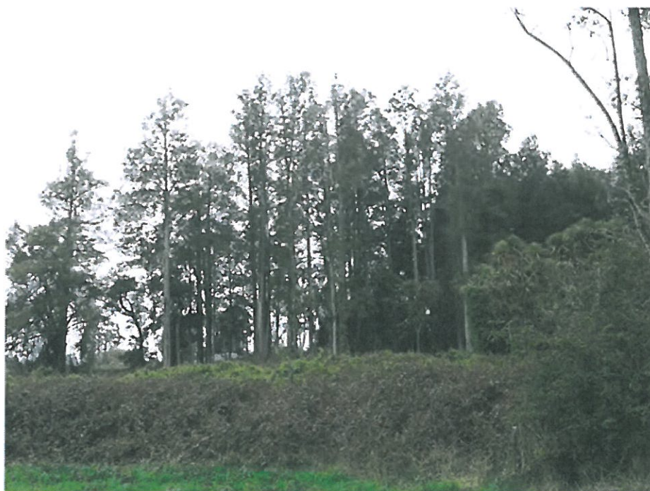
Photo 17. Section of western area that could be enhanced through weed control and restoration planting.

Significance of site – The site will not be impacted by the project, however the eastern section is of high ecological value in the context of the general landscape. The entire site offers significant opportunities for restoration to be undertaken and it is recommended that the site should be legally protected. The site qualifies for WRC indigenous biodiversity significance under criteria 3 (long-tailed bat activity) and 4. The site is not listed as an SNA under the proposed WCC DP.