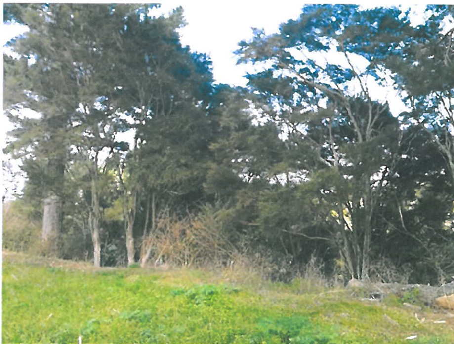
Photo 8. The area of potential kanuka gecko habitat at the top of the gully that will be impacted by the project.

Significance of site – More than 75% of the site is exotic vegetation with limited habitat provision. However approximately 80-100 m 2 of C. geminata /kahikatea wetland will be lost within the partly restored gully. Long-tailed bat activity is known in this section of gully and this will trigger Criterion 3 of the WRC criteria for ecological significance. This site also includes SNA 56 identified in Map 64B of the HCC Proposed District Plan; the affected kanuka around the edge of the gully falls within this (SNA 16.15 as described by Cornes et al., 2012).