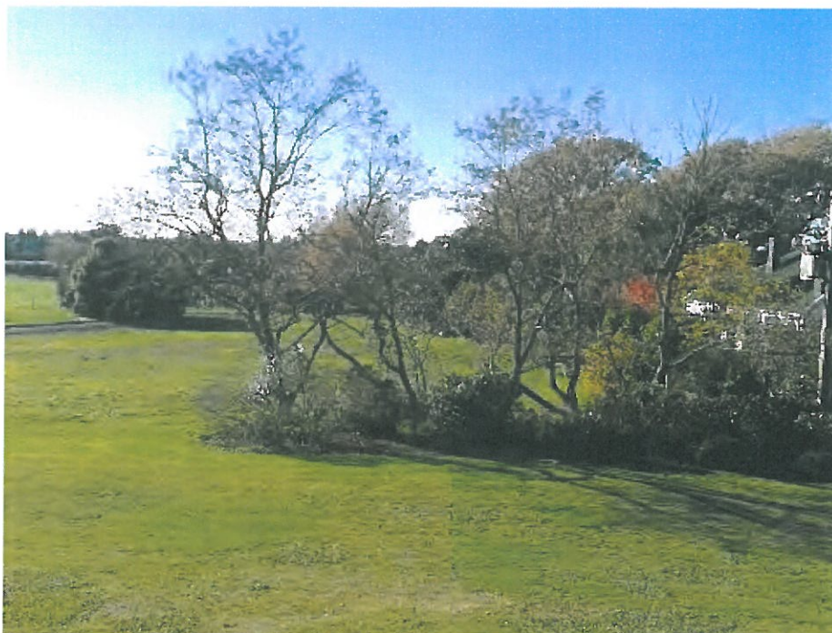
Photo 18. The Eman property, with extensive mown lawns and exotic plantings.