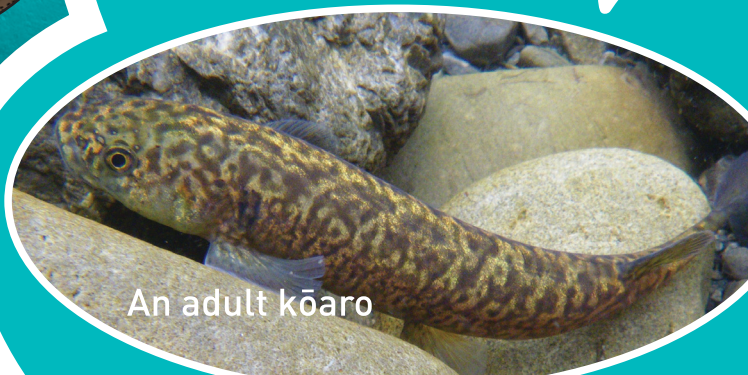
An adult kōaro