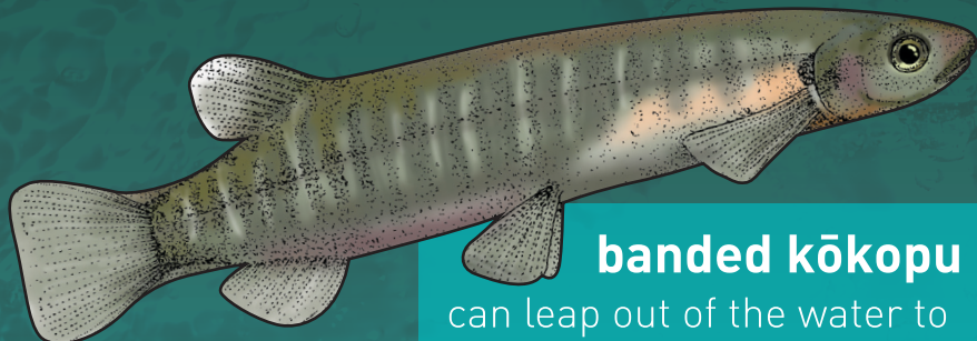
banded kōkopu can leap out of the water to grab insects off overhanging tree branches