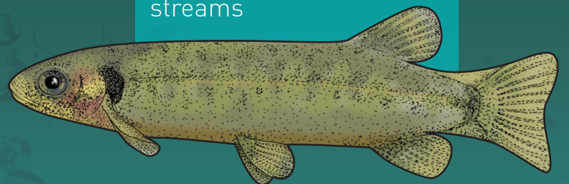
short jawed kōkopu only live in native forest streams