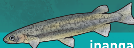
inanga used to be so common that you could scoop them out of rivers by the bucketful