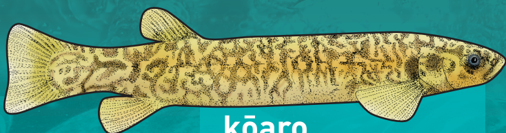
kōaro can climb straight up enormous waterfalls.