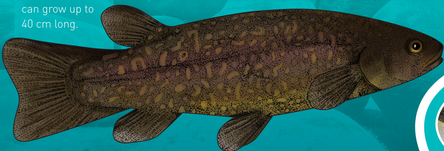
giant kōkopu can grow up to 40 cm long.